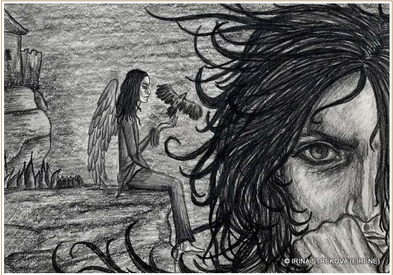
The lower guardian

Pop culture trends provides us with the training of the double in a descending line and also ones that produce cartoonish re-makes of the Knights of King Arthur and the Initiates of the Round Table via the twelve chairs of the highly trained and ethical Jedi Knights. But all these wide flung insights are left scattered and relatively useless because we really have had no higher education that can bring these stray insights together. Except with the entire body of Spiritual Science itself.